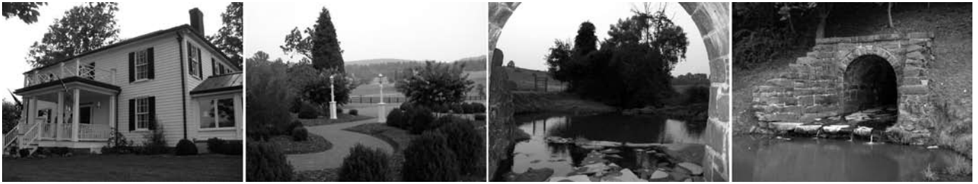
Oakley: manor house, view from garden, northern view from Fat Nancy culvert, northern end of Fat Nancy culvert.

It was a time of lawn chairs and portable tables, picnic baskets, and perhaps some new recipes – yes, it was a fine season of Orange County Historical Society Summer Picnics!