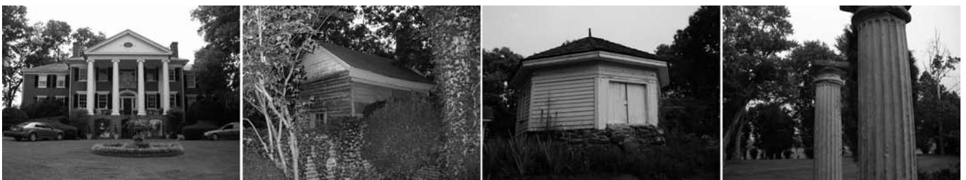
Tetley: manor house, slave quarter, ice house, side garden.