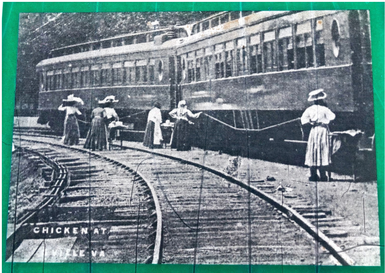
Photographer and origin of the picture on the information panel are unknown.

A photo from the information panel entitled "Gordonsville's Legendary Chicken Vendors" is below: :