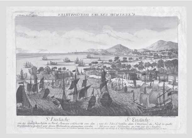
An eighteenth-century engraving of the 1781 invasion of St. Eustatius by British Admiral George Rodney.

Now, fast forward to 1776. The British are gearing up to deal with a pack of unruly rebels in their North American