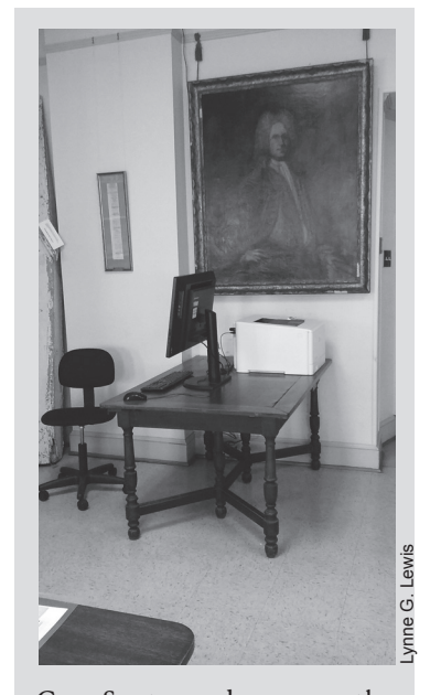
Gov. Spotswood oversees the new computer station that will be used for accessing our digitized collections.

This is another project that has received a huge boost from our generous