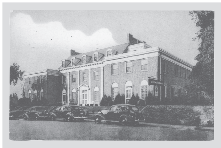
The Madison Hotel hosted a contingent of Thai Spies during their visit to Orange. Postcard, postmarked 1942.

Late in the fall of 1942, the training of the first of the "Thai Spy" groups was complete, and they were ready for insertion into