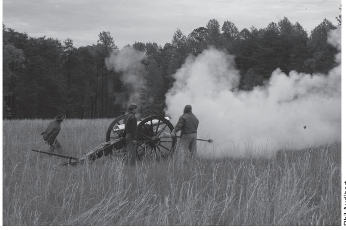
Re-enactors portray Poagues Battery in the Widow Tapp Field at the 145<sup>th</sup> anniversary of the Battle of the Wilderness.

The 145<sup>th</sup> Anniversary of the Battle of the Wilderness was celebrated on the weekend of May 2-3 at the Fredericksburg and Spotsylvania National Military Park. The theme of this year's events, "Uncommon Hardship: Soldier and Civilian in the Wilderness," took special note of the experiences of the ordinary citizens and soldiers who were swept up into the maelstrom of that battle.