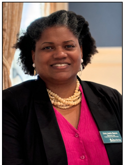
PHOTO BY HILARY HOLLADAY, EDITOR OF BYRD STREET , A NEW LOCAL ELECTRONIC NEWSLETTER. CLICK HERE TO LEARN MORE: HTTPS://BYRDSTREET.SUBSTACK.COM/

"I write this message with a heavy heart as I have unexpected family needs that