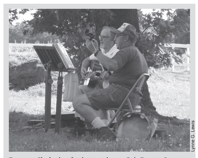
Evergreen Shade plays for the picnickers at Oak Grove in June.

On September 25, the historical documentary Someday